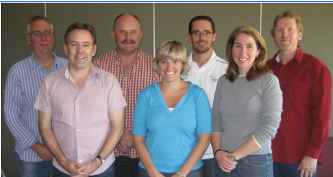
DSA Board of Directors and Staff