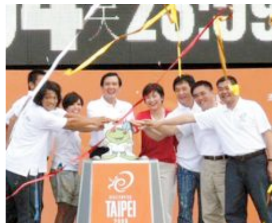
Photo: President Ma Ying-jeou, center, with participants at the event together activated a 365-day-countdown clock and wished for a smooth and successful games in the 2009 Taipei Deaflympics. (The China Post)

The Deaflympics date back to 1924 when the first Summer Deaflympics were held in Paris, France. In 1995 the Games received official recognition by the International Olympic Committee. Today, 96 national deaf sports federations are members of the International Committee of Sports for the Deaf.